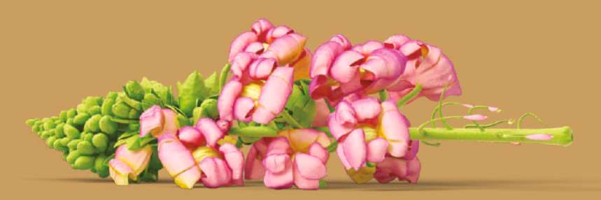
RECOMMENDED FOR NORMAL, VIRGIN HAIR, DAILY USE

Jojoba is a light and non-greasy emollient- it fills in cracks that are on the surface of the hair cuticle, therefore helping to repair hair damaged by heat styling. The antibacterial properties in jojoba soothe the scalp and can be used to treat dry scalp conditions such as dandruff. Jojoba penetrates the hair follicle strengthening and hydrating hair from the inside producing shine, elasticity and softness.